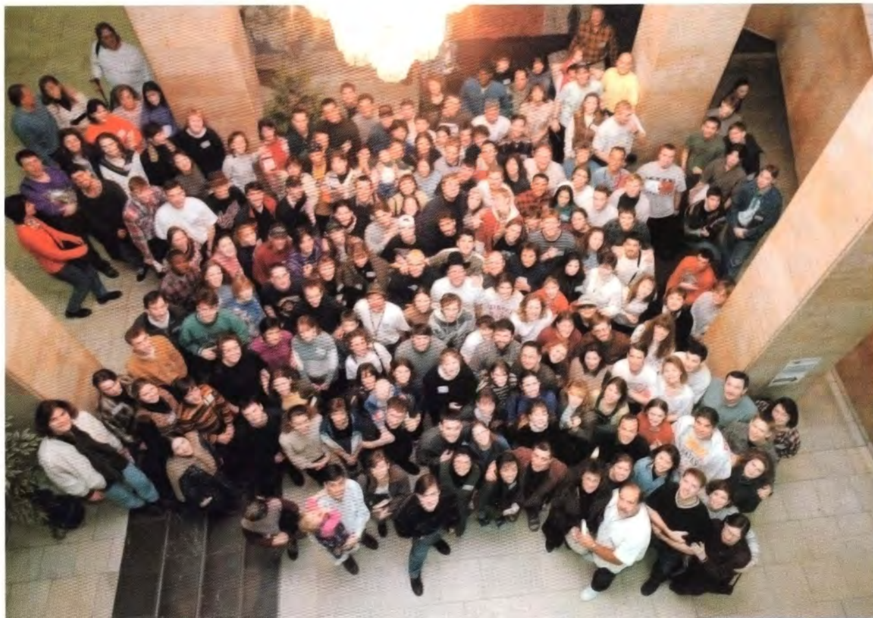
Some of the 450 conference attendees pose for a photograph in the lobby of the hotel.

Pastors from the United States and Europe come to teach and encourage those who have dedicated their lives to ministry in Russia and the surrounding countries. Missionaries who have served for many years in the field also participate in the teachings. Special worship is led by the worship teams from several of the fellowships in Russia.