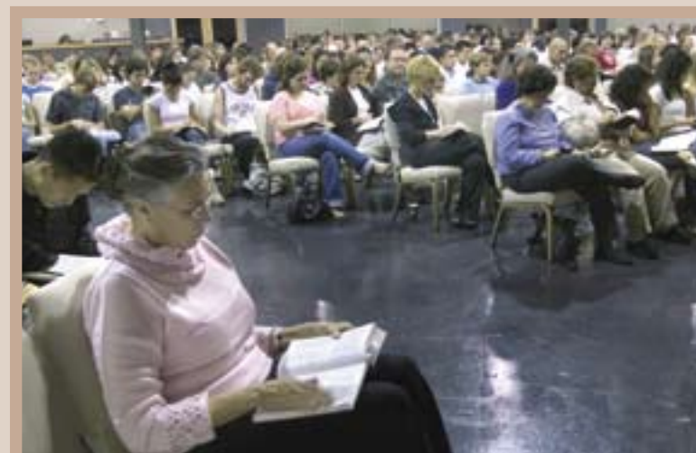
Once the lights are on, believers study God's Word.