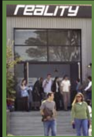
Carpenteria is a beach community 80 miles north of Los Angeles. Reality has two Sunday services.

Reality Carpinteria creates an "afterglow" atmosphere for worship by having only stage lights to encourage worshipers to freely express praises to the Lord.