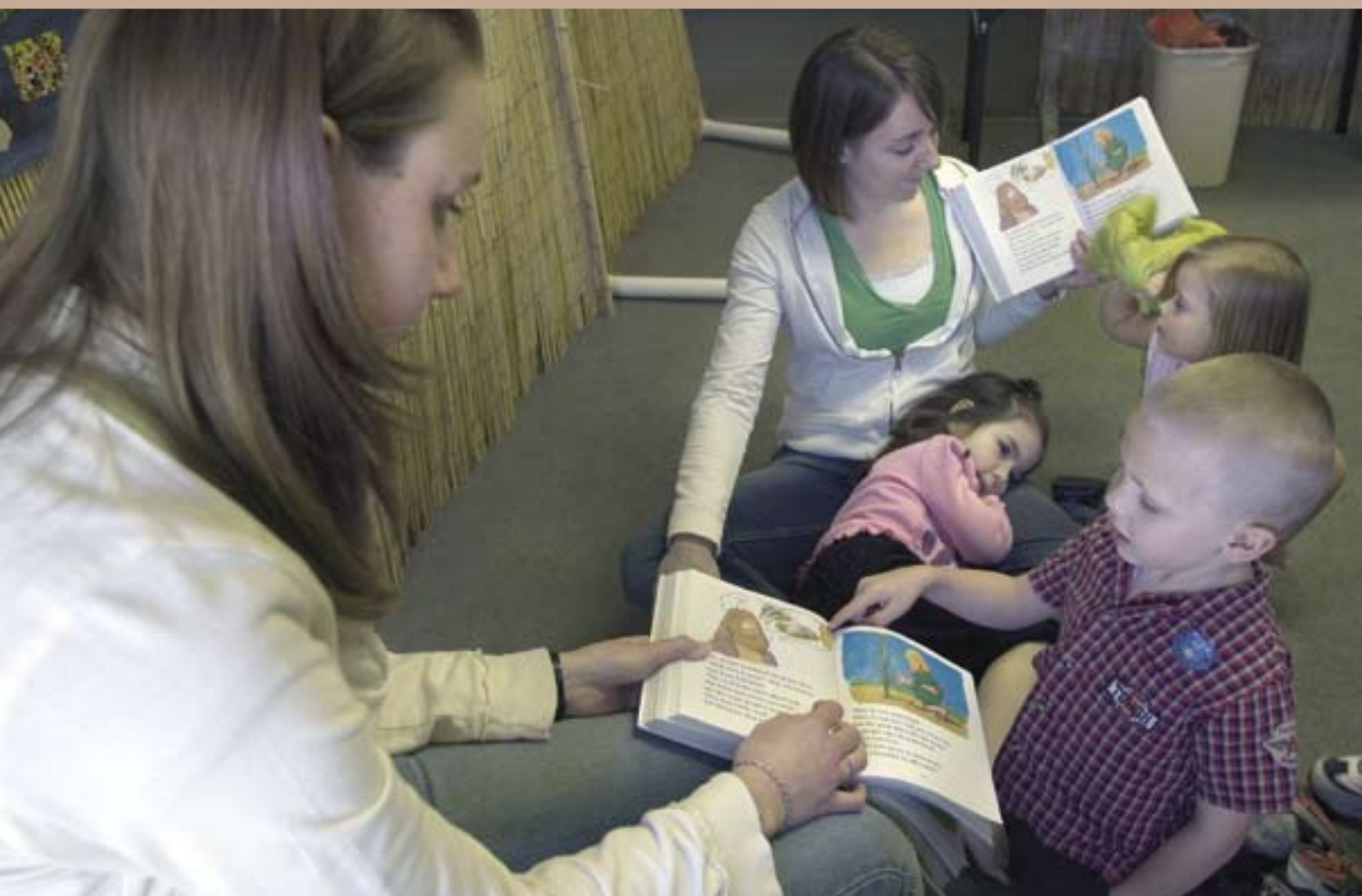
Preschoolers hear the Word of God in a kid-friendly environment.

on several trips to play with and minister to the orphans.