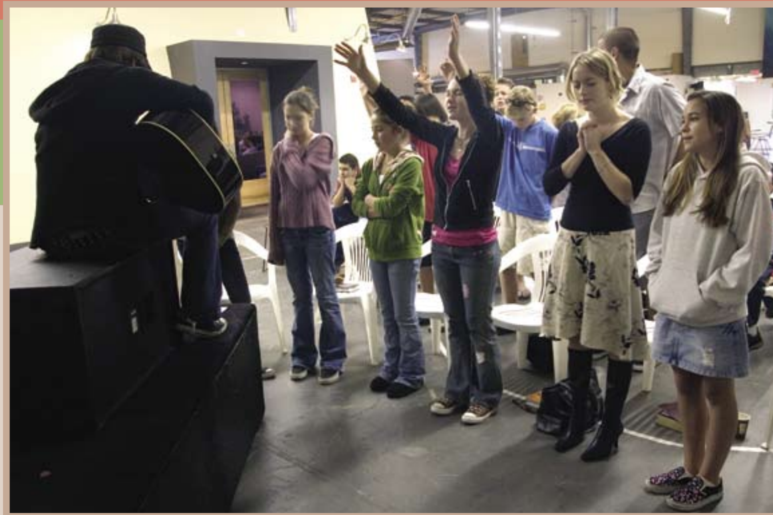
Teens have a separate time of worship in song and the study of the Word.