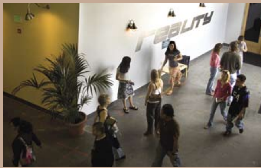
Reality derived its name from the certainty of God and the truth of His Word.